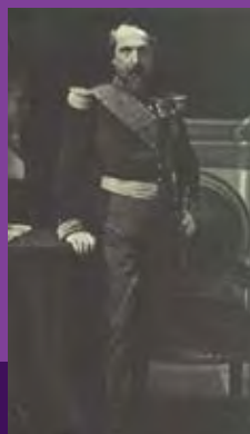
NAPOLEON III, 1863 SECTION FROM PAINTING BY JEAN HIPPOLYTE FLANDRIN

Scored for piano and harmonium, in the hands of a genius such as Rossini, this unusual combination of instruments combines brilliance and pathos in glorious harmony.