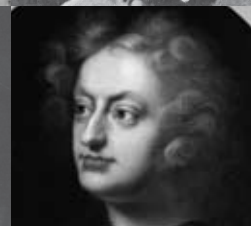
SIR JOHN TAVENER