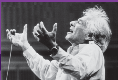
LEONARD BERNSTEIN

Chichester Psalms , with its Hebrew text, is one of the most challenging works in the entire choral repertoire as well as being one of the most affirmative and serene.